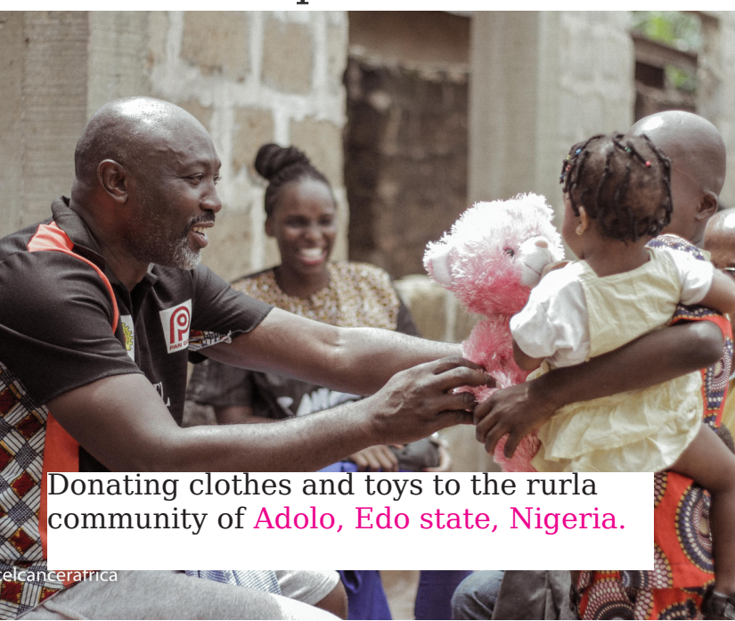
Donating clothes and toys to the rural community of Adolo, Edo state, Nigeria .