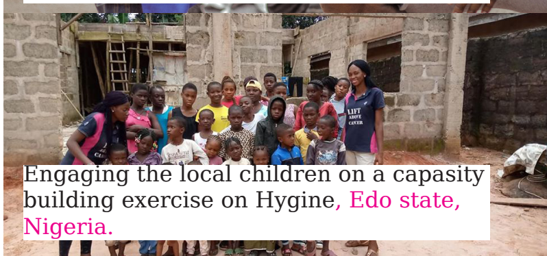
Engaging the local children on a capacity building exercise on Hygiene, Edo state, Nigeria.