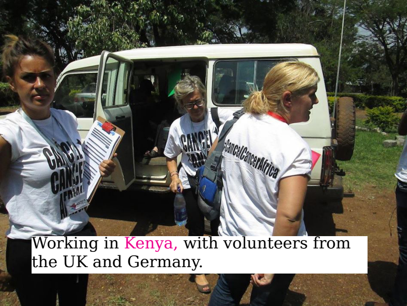
Working in Kenya , with volunteers from the UK and Germany.