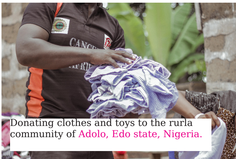
Donating clothes and toys to the rural community of Adolo, Edo state, Nigeria.