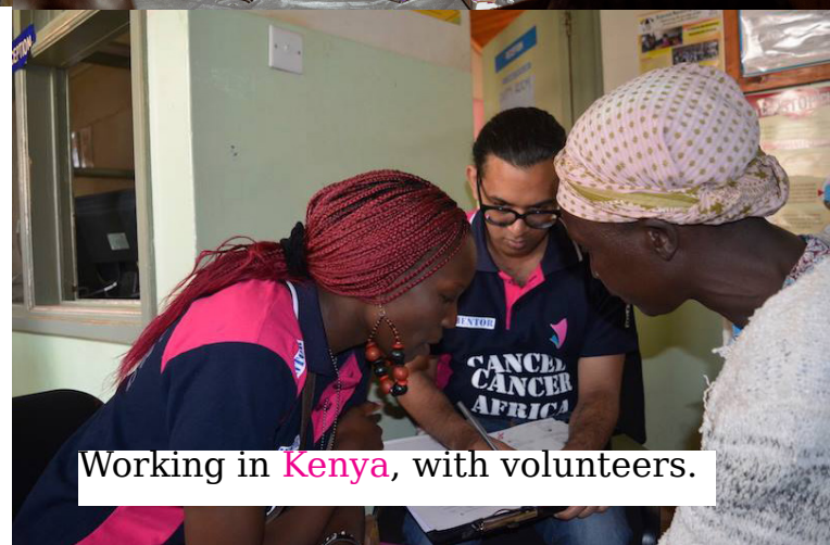
Working in Kenya , with volunteers.