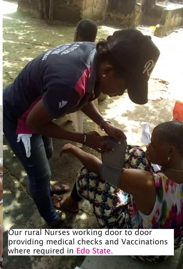
Our rural Nurses working door to door providing medical checks and Vaccinations where required in Edo State .