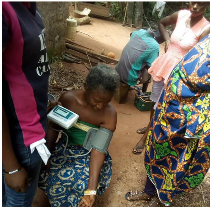
Our rural Nurses working door to door providing medical checks and Vaccinations where required in Edo State .