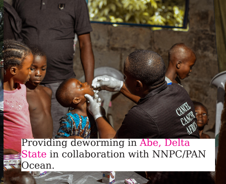
Providing deworming in Abe, Delta State in collaboration with NNPC/PAN Ocean.