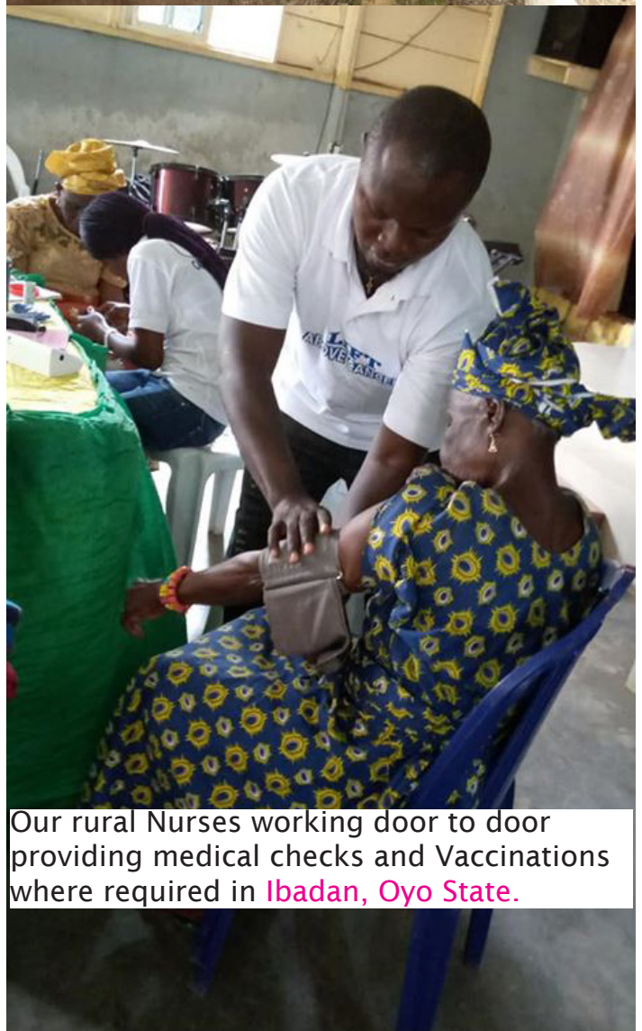
Our rural Nurses working door to door providing medical checks and Vaccinations where required in Ibadan, Oyo State .