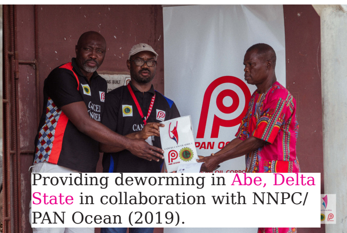
Providing deworming in Abe, Delta State in collaboration with NNPC/PAN Ocean (2019).